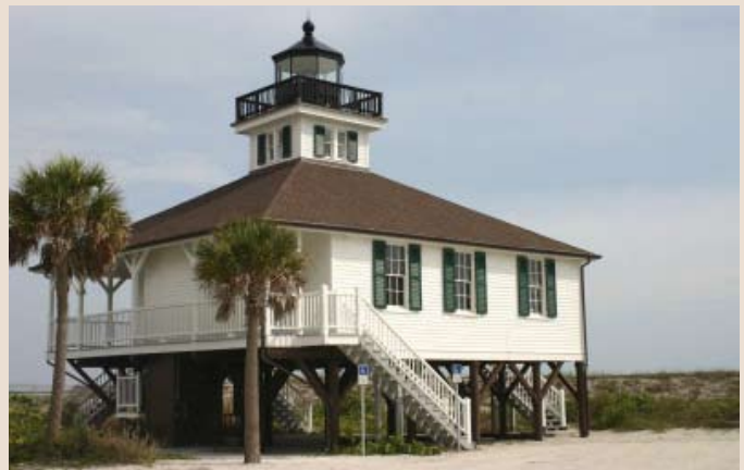
The Boca Grande Lighthouse in Southwest Florida has guided visitors into Charlotte Harbor since 1890.