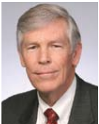
Connie Mack, III United States Senator, retired